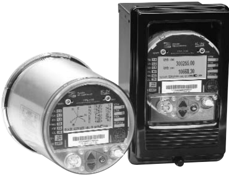
Socket Mount model